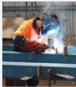
FABRICATION & WELDING