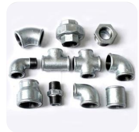
GI & MI FITTINGS

For more products, visit our website: https://targettzone.com