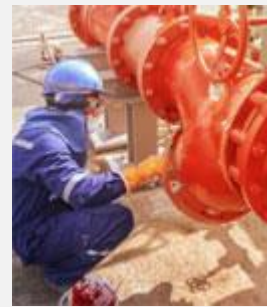
PAINTING & SPECIAL COATING