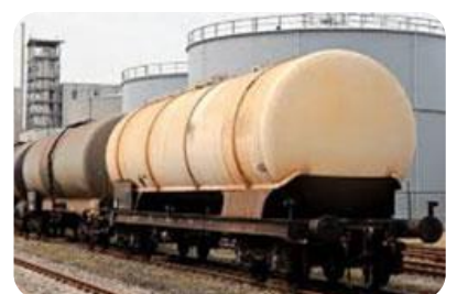
Oil Rail Industries