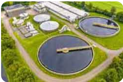
Sewage & Water Treatments