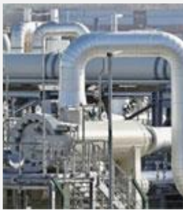
PIPELINE PROJECT PACKAGES

We offer comprehensive services including procurement and supply of oilfield equipment, chemicals, and instrumentation, along with logistics and project support. Our expertise covers maintenance, repair, and operations (MRO), offshore and onshore solutions, and tailored supply chain management to ensure seamless, safe, and efficient operations across energy and industrial sectors.