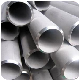
PIPES & TUBES

Targett Zone Oilfield Trading FZCO is a leading supplier of oilfield equipment and industrial materials, serving the needs of Oil & Gas, petrochemical, power & desalination, marine, shipbuilding, civil construction, and other allied industries. The company specializes in providing high-quality products that meet international standards, ensuring reliability, durability, and performance across demanding projects.