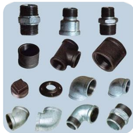
MALLEABLE IRON FITTINGS