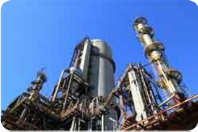
Oil & Gases

We serve industries across UAE and global regions, including oil and gas, petrochemicals, refining, drilling, offshore, power generation, and industrial construction. Our solutions cover equipment, chemicals, instrumentation, logistics, and MRO support, ensuring reliable operations with efficiency, safety, and sustainability.