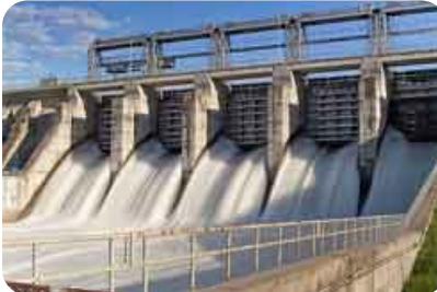
Hydro Powers & Dams